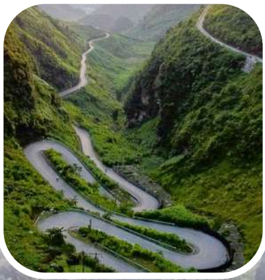
Ma Pi Leng pass

Lunch and dinner at Vietnamese restaurant