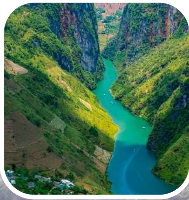
Tu Sản canyon