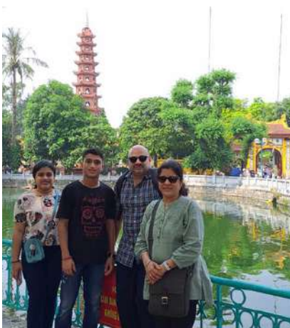
Tran Quoc Pagoda

Distance Noi Bai Airport – Hanoi Central: 30 km => 50 minute transfer