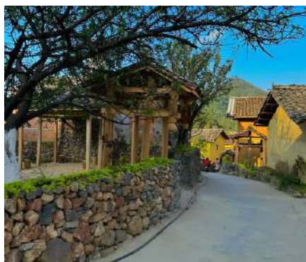
Lo Lo Chai village