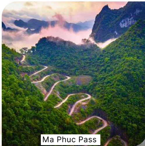
Ma Phuc Pass