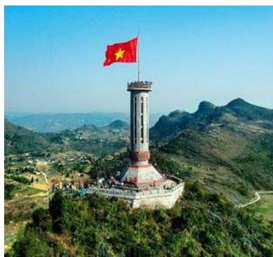
Lung Cu National Flag Point

Lunch and dinner at Vietnamese restaurant