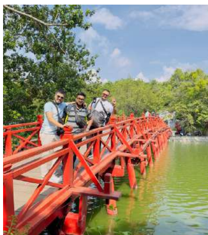
Hoan Kiem Lake