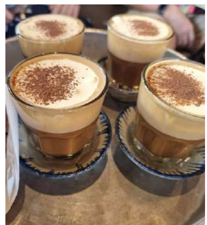
Hanoi Egg Coffee