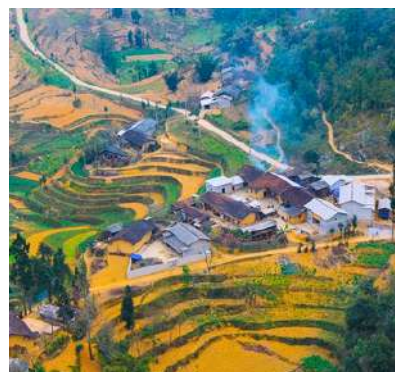
Lo Lo Chai village Overview