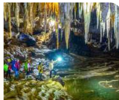
Nguom Ngao Cave