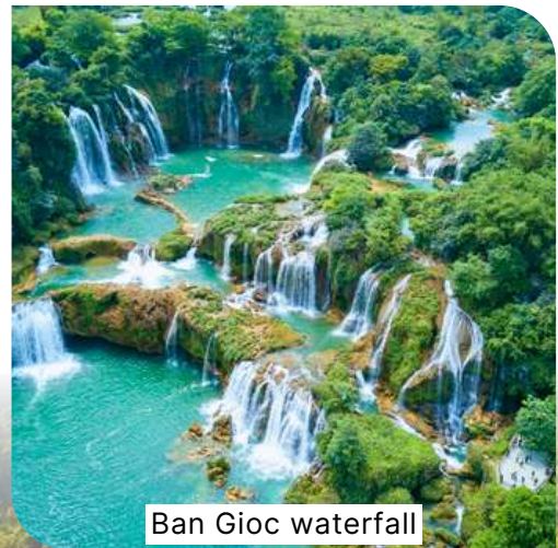
Ban Gioc waterfall